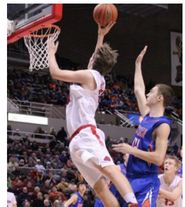
Championship Game Score St. Anthony 49 - Okawville 46