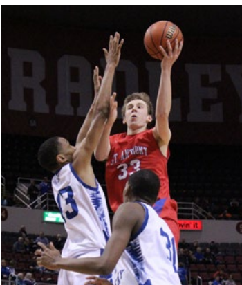
Semi Final Score St. Anthony 43 - Chicago Hope 34

The St. Anthony Bulldogs are your 2017 Illinois 1A Boys Basketball State Champions! Facing the top ranked Okawville Rockets in the championship game, the Bulldogs pulled out an overtime thriller for a 49-46 win, securing the first basketball State Title in the history of both St. Anthony Schools and the City of Effingham.